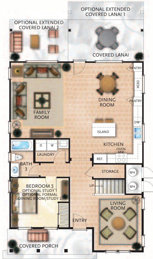
FIRST FLOOR EXTERIOR A