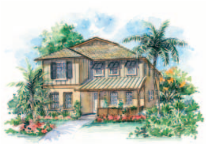
RESIDENCE 40.40 C (R)