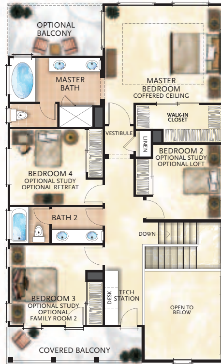
SECOND FLOOR EXTERIOR A