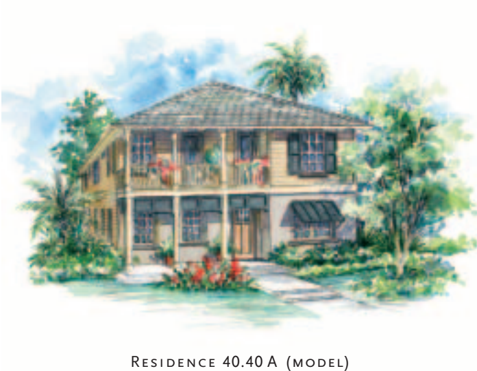
RESIDENCE 40.40 A (MODEL)