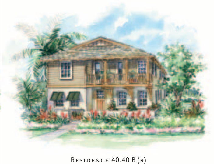
RESIDENCE 40.40 B (R)