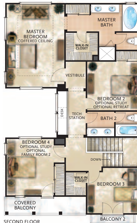
SECOND FLOOR EXTERIOR B