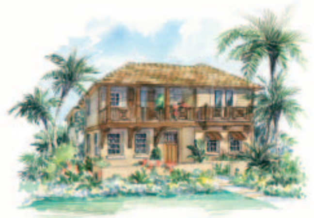
RESIDENCE 40.30 B (MODEL)