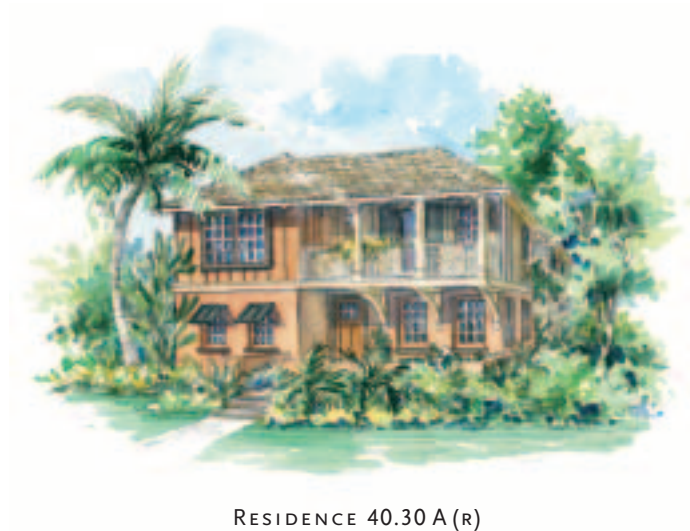
RESIDENCE 40.30 A (R)