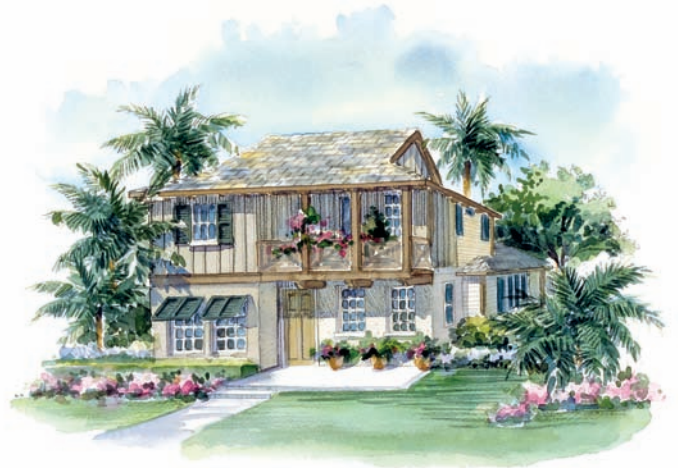
RESIDENCE 30.30 B (R)