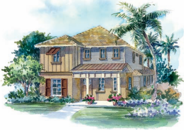
RESIDENCE 30.30 A (R)