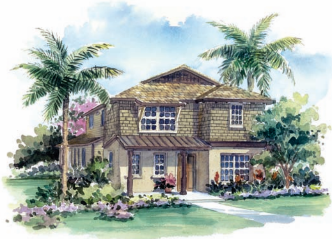
RESIDENCE 30.30 C (MODEL)