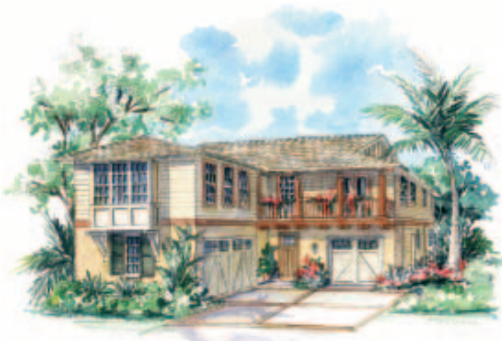
RESIDENCE 60.40 A (R)