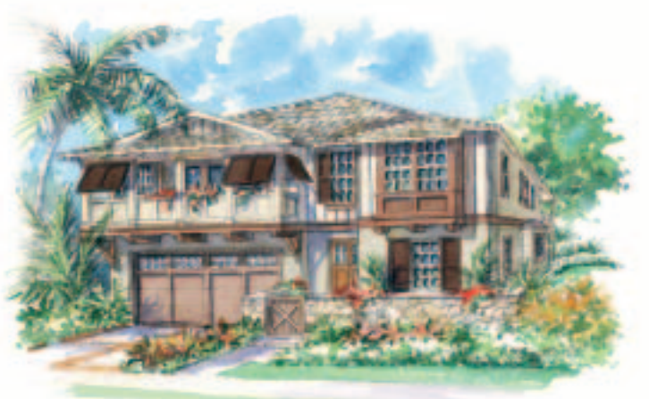
RESIDENCE 60.30 B (MODEL)