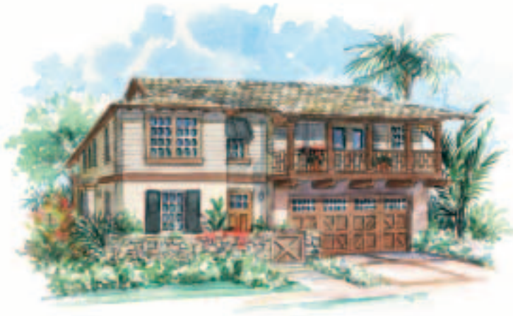
RESIDENCE 60.30 A (R)