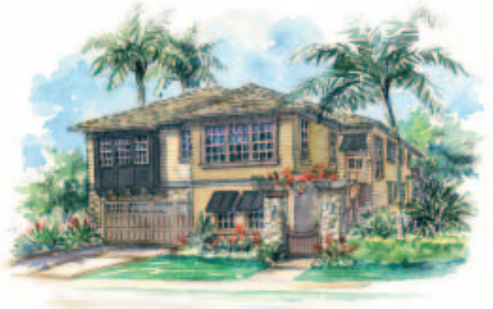
RESIDENCE 60.20 B (MODEL)