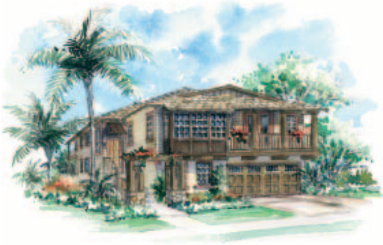
RESIDENCE 60.20 A (R)