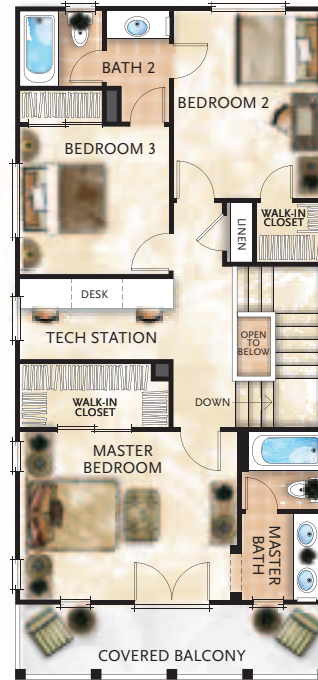
SECOND FLOOR EXTERIOR A