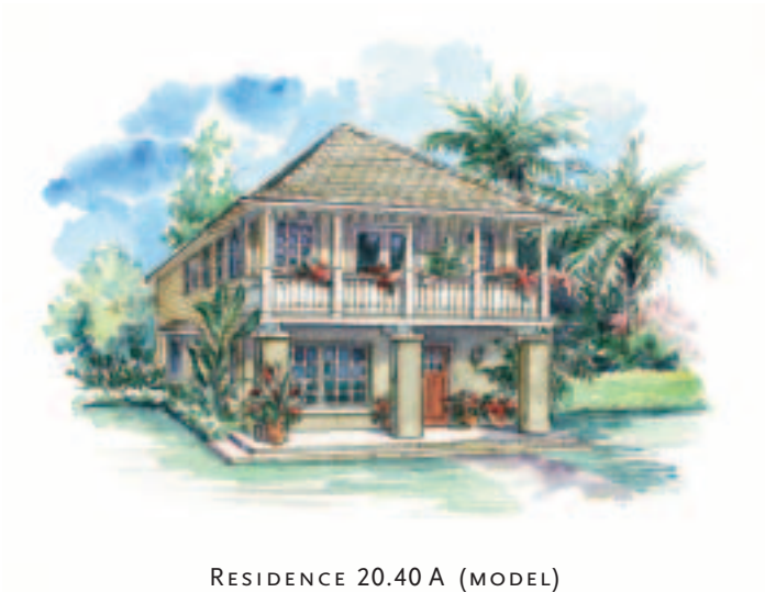
RESIDENCE 20.40 A (MODEL)