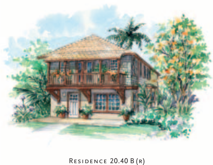
RESIDENCE 20.40 B (R)