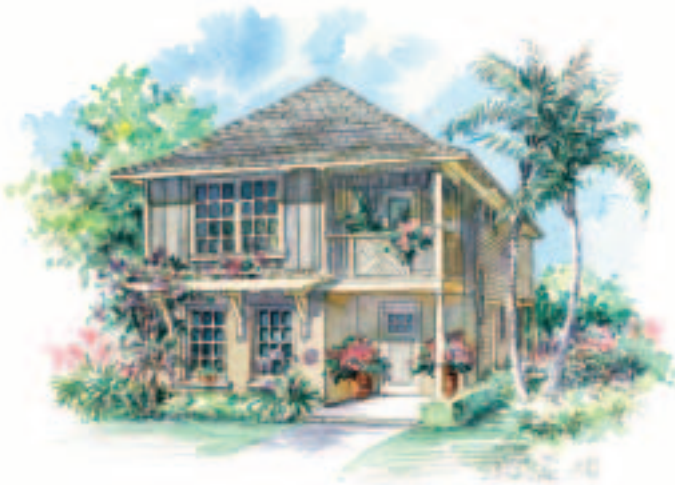
RESIDENCE 20.30 A (R)