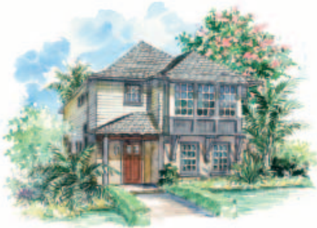
RESIDENCE 20.30 C (MODEL)