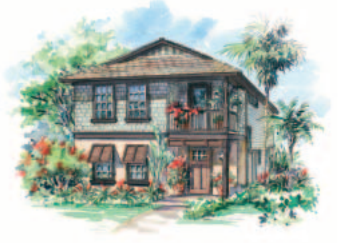
RESIDENCE 20.30 B (R)