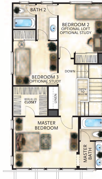
SECOND FLOOR EXTERIOR B