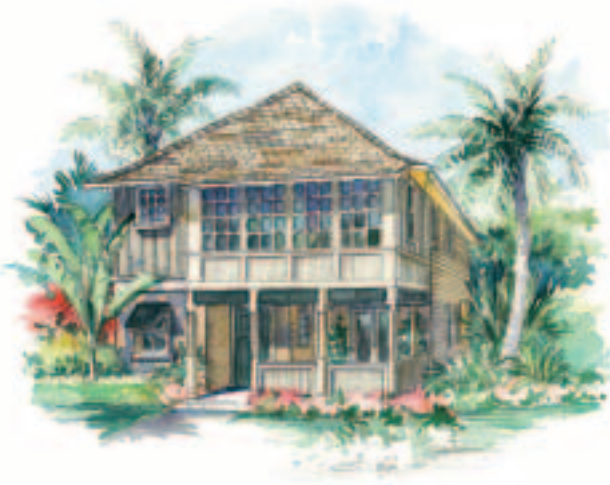
RESIDENCE 20.20 A (R)