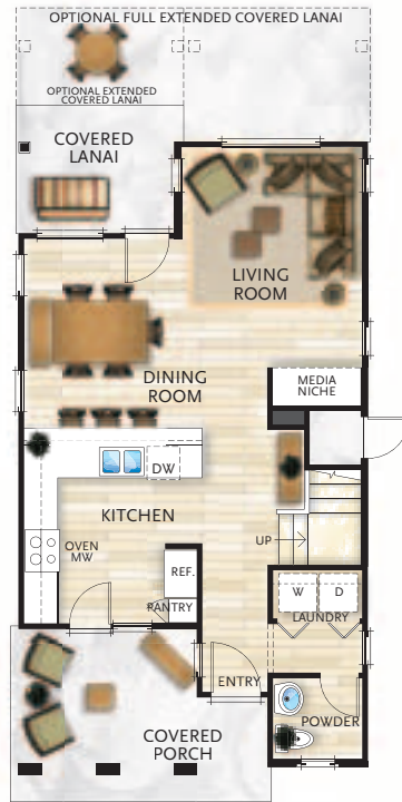
FIRST FLOOR EXTERIOR B