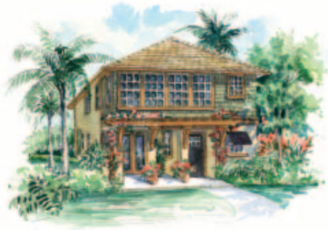
RESIDENCE 20.20 B (MODEL)