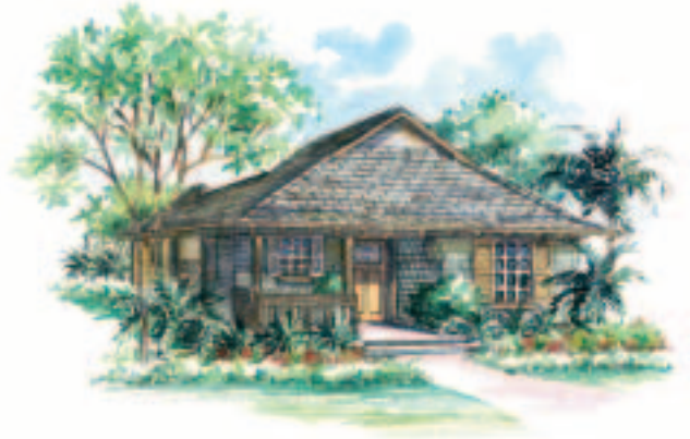
RESIDENCE 20.10 B (R)