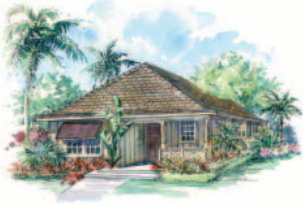
RESIDENCE 20.10 A (MODEL)