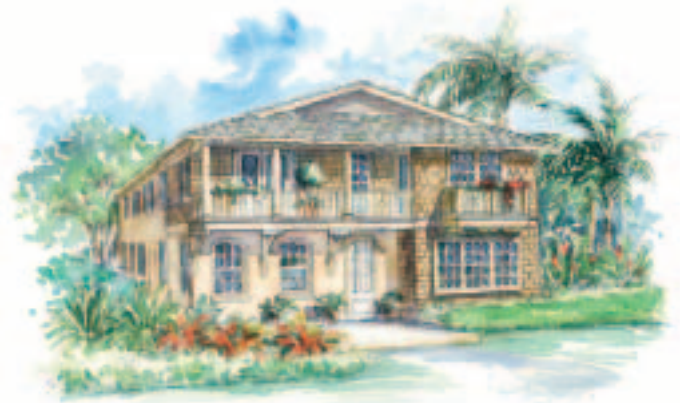
RESIDENCE 50.30 B (R)