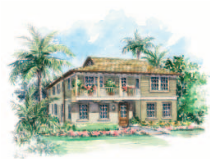
RESIDENCE 50.30 C (R)