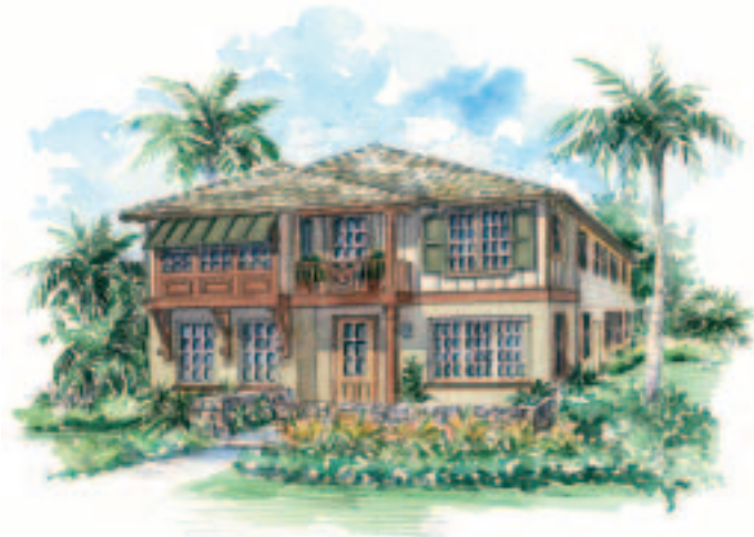
RESIDENCE 50.30 A (MODEL)