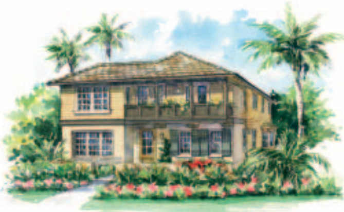
RESIDENCE 50.20 C (R)