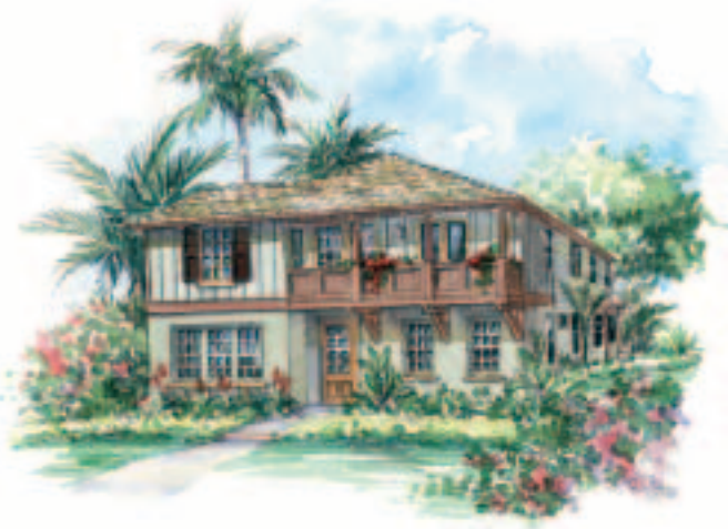
RESIDENCE 50.20 A (R)