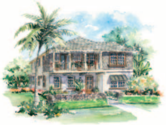
RESIDENCE 50.20 B (MODEL)