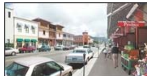
... made over for tomorrow