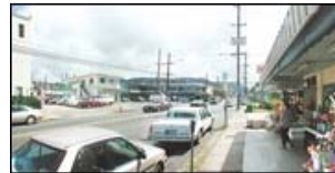
Urban today ...

The Kapolei project, called Mehana, covers 135 acres on the makai fringe of Kapolei's unfinished civic center, and